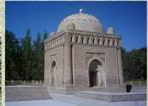
"Ismail Samani" Mausoleum